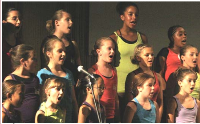
Stage Performance Saturday July 13 th Certificate of completion included